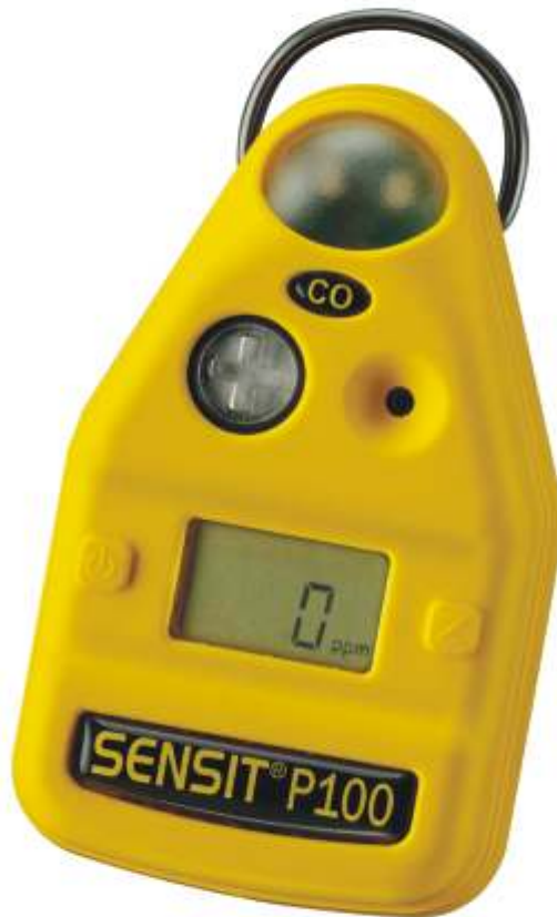
Actual Size of Instrument